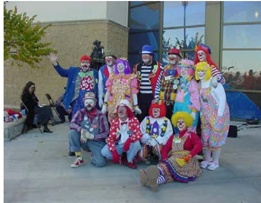
Pictured: Tender Loving Clowns